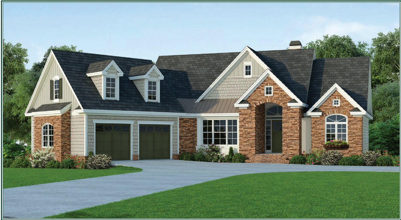
© 2008 Donald A. Gardner Architects, Inc.